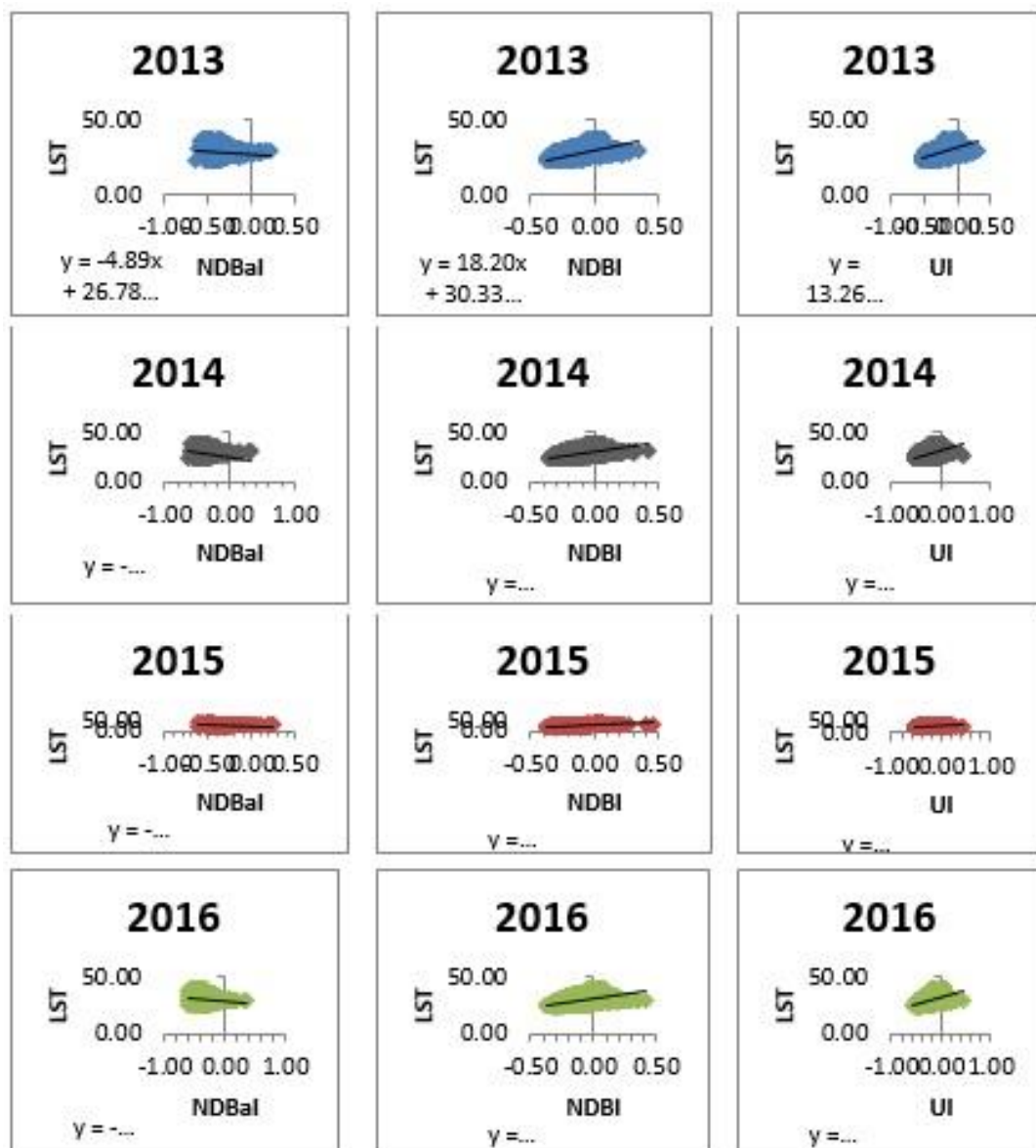
Figure 4. Relationship of LST and urban indices for period 2013-2016

We see that with the increasing “mean” parameter value of the index NDBaI, there appears a slight decrease in the value of R^2 coefficient of linear function. The strongest correlation between LST and UI is in 2013 when R^2 is about of 0.53, while the highest value of R^2 for relationship LST-NDBI is 0.49 in 2015