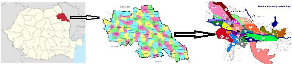
Figure 1. Study Area (www.hih.ro, www.apavital.ro)

The study area is geographically situated on latitude 47°12'N to 47°06'N and longitude 27°32'E to 27°40'E. The largest city in eastern Romania is the seat of Iași County. Iași is located in the historic region of Moldavia and it has traditionally been one of the leading centres of the Romanian social, cultural, academic and artistic life. It is the "legendary city of the seven hills", namely Copou, Cetățuia, Bucium, Repedea, Șorogari, Galata, and Breazu, just like so many cities around world, one like example being Rome. Some of these hills have distinct churches perched on top, each of which warrants a different view of the city. The local climate is continental with large temperature differences between the seasons and with minimal rainfall. Iași is positioned on the Bahlui River, an affluent of Jijia that flows into the Prut River. (www.wikivoyage.org).